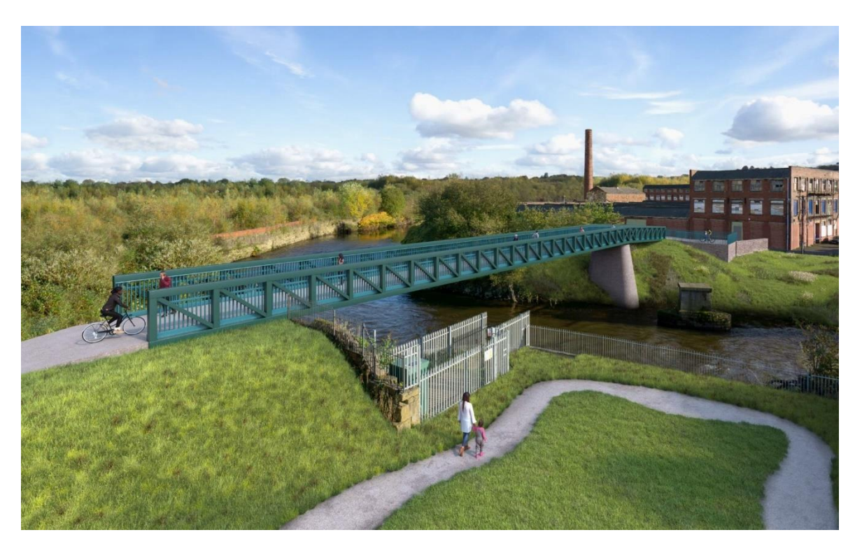
Bury: Radcliffe Central Phase 1 scheme visualisation