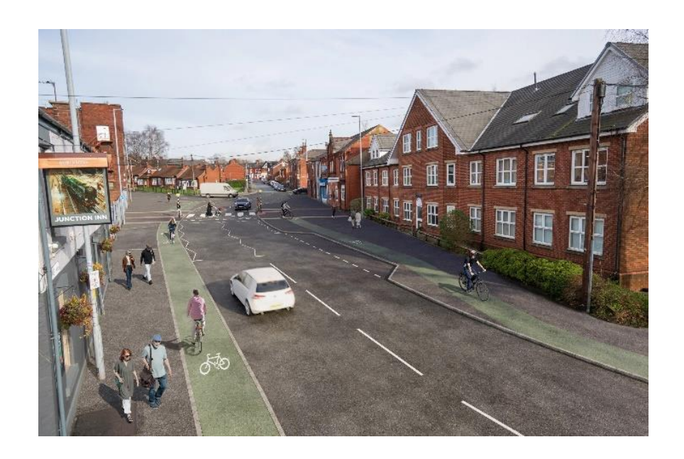
Improving Journeys: Rochdale – Oldham – Ashton QBT (Tameside elements) scheme visualisation